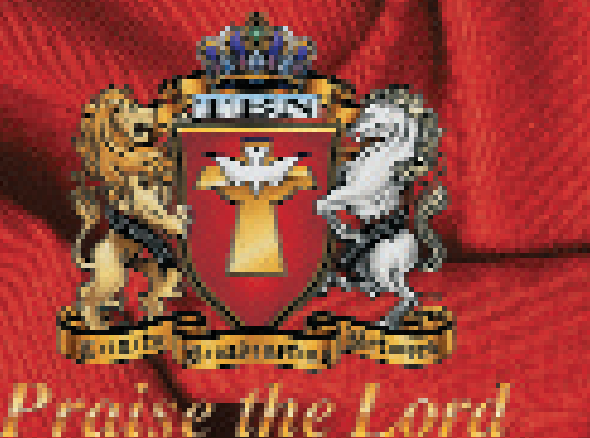
JULY 2004 · VOLUME XXXI · NUMBER 7