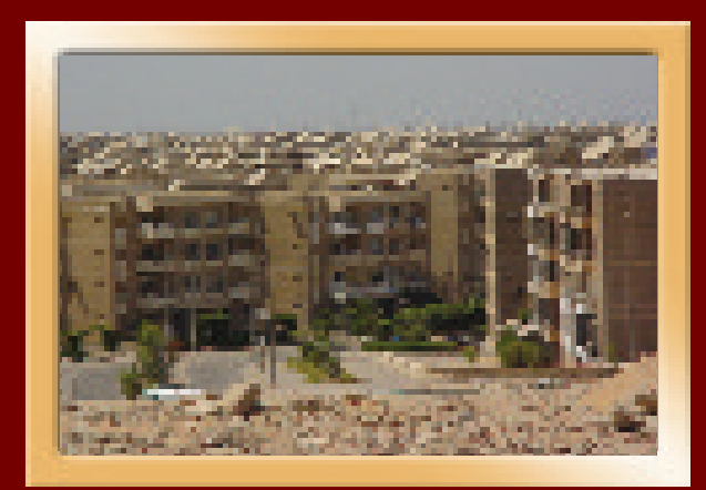
Virtually every building in Cairo has its own satellite receiving dish! And now TBN will be accessing even more homes with not only TBN programs, but also the Church Channel and JC-TV, since changing to digital satellite broadcasting on Hotbird 6 this past May.

Yes, peace is coming, but only when the "PRINCE OF PEACE" arrives! Hear the Word of the Lord: