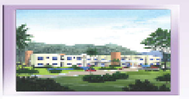
Yes, in Jesus' Name, our Smile of a Child children's hospital in Haiti is being built!