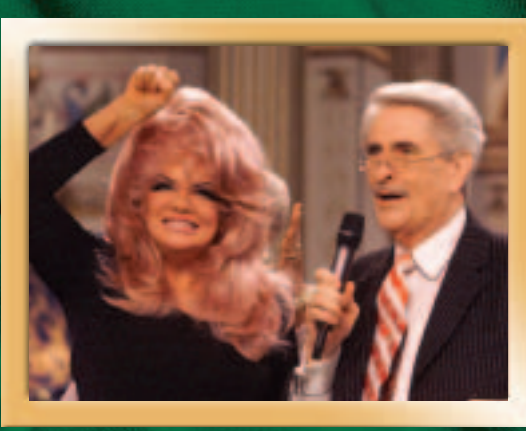
2005 — A great VICTORY FILLED year for YOUR TBN!