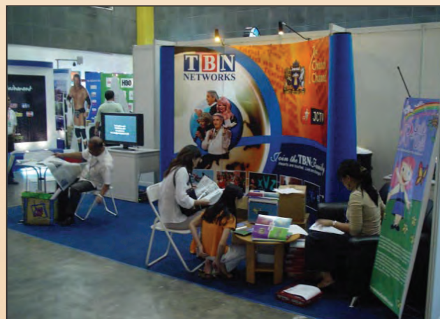
Representatives from TBN and its affiliated networks: Smile of a Child, JCTV, and The Church Channel attended last year's Asian cable convention in Manila.