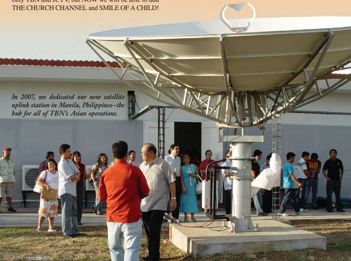
In 2007, we dedicated our new satellite uplink station in Manila, Philippines—the hub for all of TBN's Asian operations.