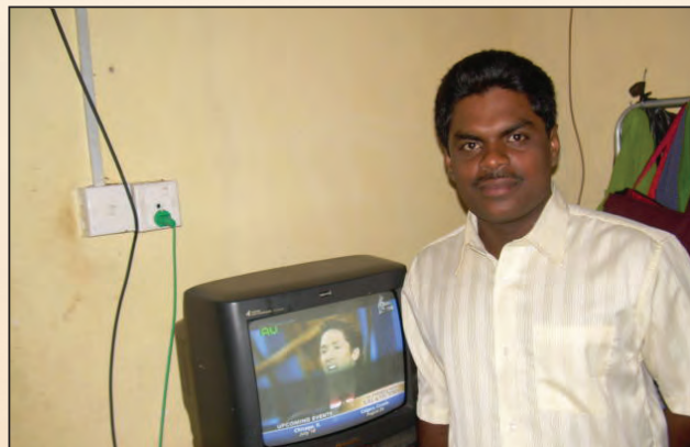
Joel Osteen's program is coming through loud and clear to the whole nation of Sri Lanka!