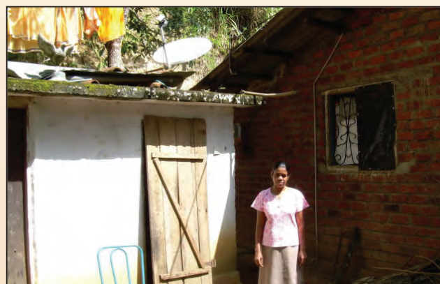
Hundreds of TBN's satellite receiving dishes—provided by YOU, our precious partners—are being installed in homes and villages throughout Sri Lanka.