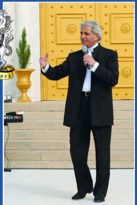
Benny Hinn preaching at the steps of the Great Temple.