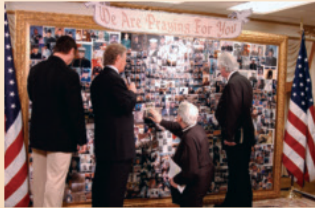
TBN's military prayer walls are covered with thousands of photographs of men and women serving in the armed forces. Please keep our military heroes in prayer. They are keeping America strong and free!

men and women locked up in prisons — many for life? Yes, what has happened to the lyric from America the Beautiful :