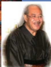
HM King Siaosi (George) Tupou V

In 2006, TBN joined the people of Tonga in mourning the loss of their beloved sovereign, Taufā'ahau Tupou IV. King Tupou was a great friend of TBN and we were honored to have him as our guest on Praise the Lord , as well as officiate at the 2001 dedication of Channel 33, TBN's affiliate station in Tonga. King Tupou has been succeeded by his son, King Siaosi (George) Tupou V, who celebrates his coronation this month of August. We pray and wish King Tupou V God's blessings and rejoice that the Kingdom of Tonga will go on and Christian television will continue under his reign.