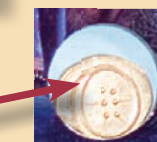
Gold coin replica

To pledge, go to www.tbn.org or call 1-888-731-1000 (toll free in the U.S. and Canada)