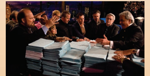
Join your great worldwide TBN family for revival PRAISE-A-THON the week of November 2-7!

Did you ever wonder just how Jesus supported His ministry as well as 12 men and their families? Well, this Scripture certainly gives us a glimpse behind the scenes as mostly the women gave of their means (or money) to support Jesus and His disciples! It is interesting to note here that things have not changed much — it is still mostly the women who support TBN! How do we know? I'm glad you asked — the checks are signed with the ladies' names! Now do not be upset. Gentlemen, I'm sure most of you gave permission and some of us men do give generously to keep TBN ON THE AIR around the world! God bless us all!