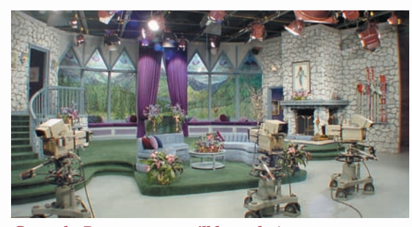
Get ready, Denver...soon we'll be producing new programsincluding "Praise the Lord"-from YOUR beautiful studio!

Starting June 12, TBN will blanket Denver with 5 MILLION WATT full power TV station KPJR Ch. 38! And the best part: all the cable stations will be required under the "must carry law" to add Ch. 38 to their program lineup. We already have a studio (pictured) to produce local programs!