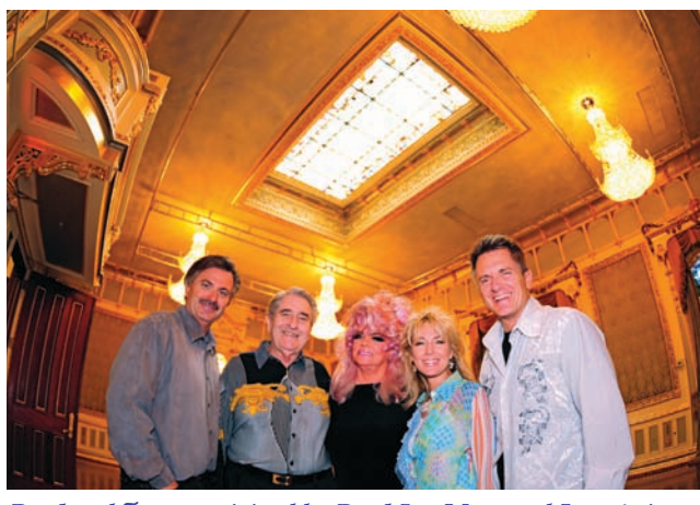
TBN's newly renovated Manhattan, NY studio.

"And he that reapeth RECEIVETH WAGES, and gathereth fruit unto life eternal: that both he that soweth and he that reapeth may rejoice together." Jn. 4:36.