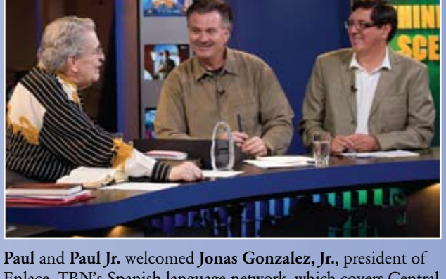
Enlace, TBN's Spanish language network, which covers Central and South America. Spain and the U.S.