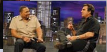
It was a great joy to have multiple award winning recording artist Aaron Neville as our special guest from TBN's Manhattan studio, hosted by Carman.