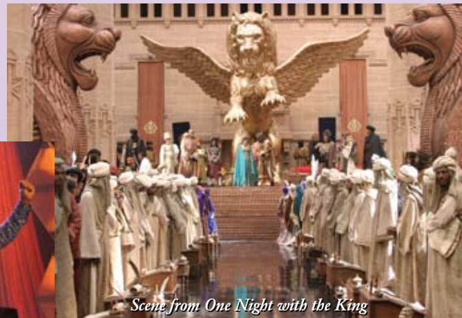
Scene from One Night with the King

PLEDGE FOR MOVIES AND SPECIALS! Classic Bible stories, end time prophecy thrillers, documentaries and movies dealing with today's contemporary issues—TBN brings you outstanding movies and specials—all commercial free! Your pledge is needed to help support this powerful and effective means of communicating the Gospel!