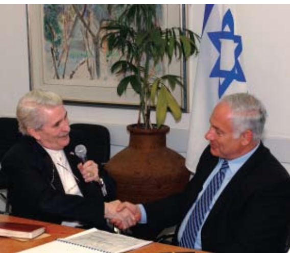
(Pictured: Paul with Israeli Prime Minister Benjamin Netanyahu). “Pray for the peace of Jerusalem” and for TBN-Russia’s new TV studio located in the heart of the Holy City!

everything they did went wrong. But, read and rejoice: