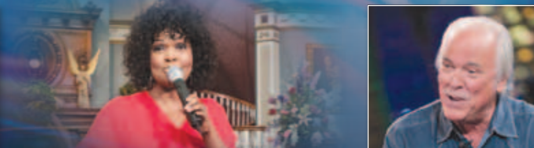
It was a delight to have Grammy, Stellar and Dove award winning gospel recording artist CeCe Winans host Praise from TBN's Atlanta, GA studios.