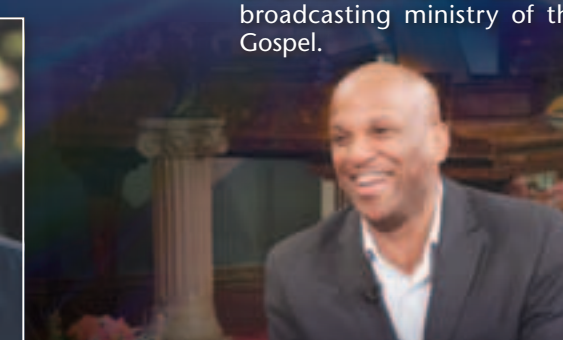
▶ Senior pastor of Perfecting Faith Church in Freeport, NY and multiple award winning gospel artist and songwriter Donnie McClurkin touched our hearts with his anointed message about the prophetic move of God in this generation.