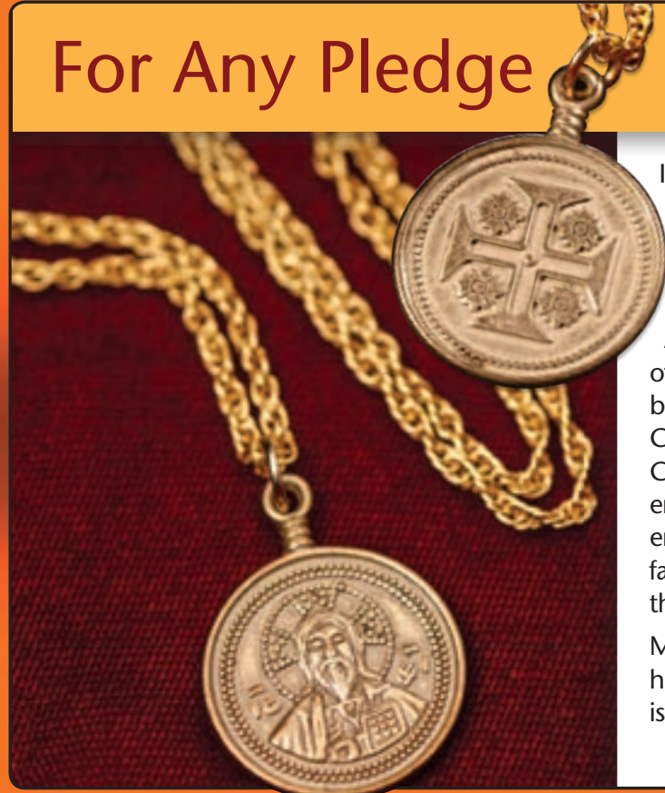
Image of Jesus on Replica Ancient Coin Necklace

In America our money is engraved with the words, "IN GOD WE TRUST." But did you know that there was a time when the actual face of Jesus Christ was engraved on the legal tender and coin of the realm ? The gold reproduction coin pictured here was issued by Michael VII Dukcas, (1071-78 AD), emperor of the Byzantine Empire, which was the center of Eastern Christendom from 324 to 1453 A.D., with Rome being the center of Western Christianity. The Eastern seat was Constantinople (now Istanbul, Turkey), named after the Emperor Constantine, who declared Christianity the state religion of his empire. It is a thrilling fact of history that many empires and emperors were so thoroughly won to Christ that the Christian faith was virtually the only religion, and that Christ was so honored that His image was minted on the coins of monetary exchange!