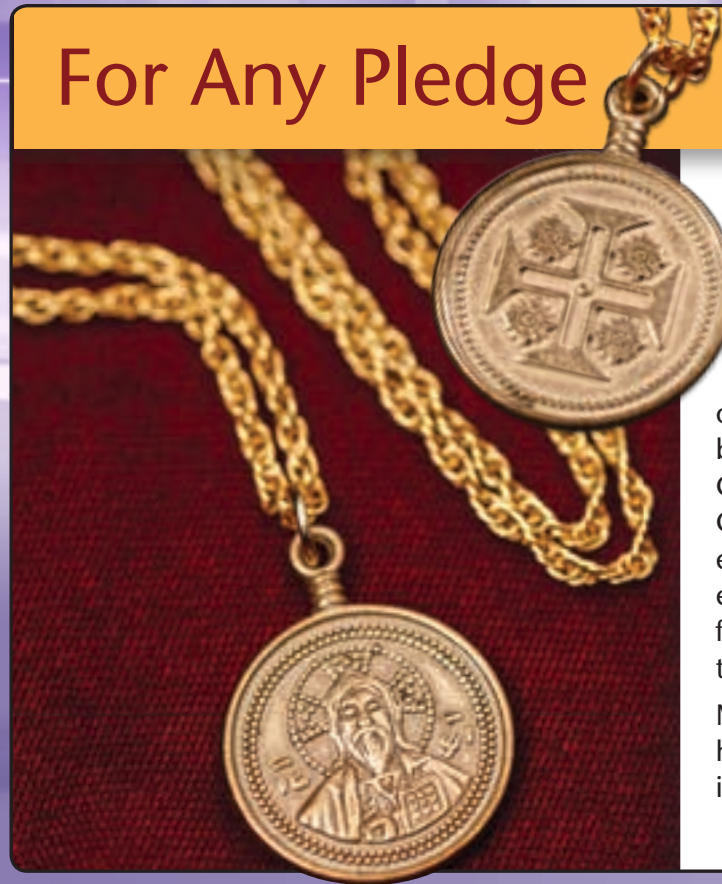
Image of Jesus on Replica Ancient Coin Necklace

In America our money is engraved with the words, "IN GOD WE TRUST." But did you know that there was a time when the actual face of Jesus Christ was engraved on the legal tender and coin of the realm ? The gold reproduction coin pictured here was issued by Michael VII Dukkas, (1071-78 AD), emperor of the Byzantine Empire, which was the center of Eastern Christendom from 324 to 1453 A.D., with Rome being the center of Western Christianity. The Eastern seat was Constantinople (now Istanbul, Turkey), named after the Emperor Constantine, who declared Christianity the state religion of his empire. It is a thrilling fact of history that many empires and emperors were so thoroughly won to Christ that the Christian faith was virtually the only religion, and that Christ was so honored that His image was minted on the coins of monetary exchange! Make or renew your Praise-a-Thon pledge and receive this historic reproduction of this unique witness to Jesus Christ that is nearly 1,000 years old!