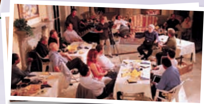
TBN's studio in Milan, Italy was the site of a historic meeting of TBN's foreign station managers. Representatives from several nations brought thrilling reports of what God is doing through TBN around the world.