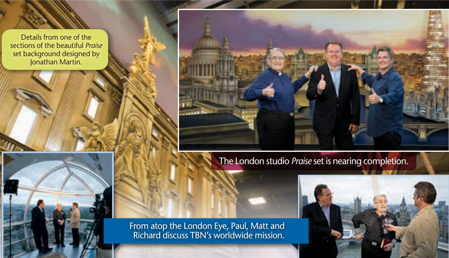
The London studio Praise set is nearing completion.

For more information about TBN, please go to www.tbn.org , or write TBN, P.O. Box A, Santa Ana, California 92711