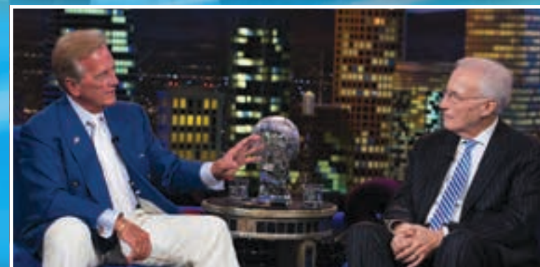
Praise host, Pat Boone, with Sid Roth.