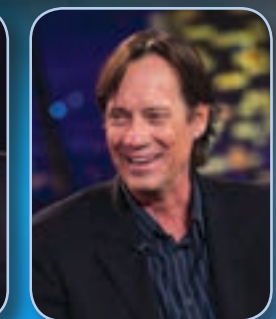
Renowned Hollywood actor, Kevin Sorbo.