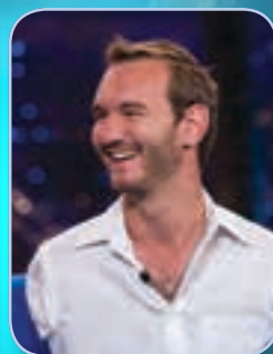
Motivational speaker and evangelist, Nick Vujicic.