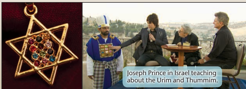
Joseph Prince in Israel teaching about the Urim and Thummim.