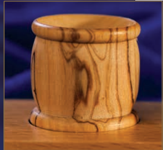
Olive wood cups made in the Holy Land.