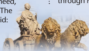
Symbol of Madrid—the Cibeles Fountain lions.