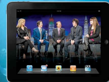
Watch Praise the Lord and other TBN programming on iTBN.org.