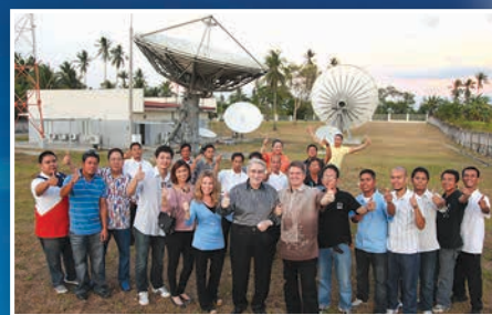
TBN's satellite hub for all of Asia in Manila, Philippines.

TBN blankets the world with the Gospel 24/7 through more than 70 international satellite channels, feeding tens of thousands of cable and TV stations and direct-to-home satellite dishes. Be a part of taking the Gospel to the "utmost" parts of the earth"—and pledge for SATELLITE!