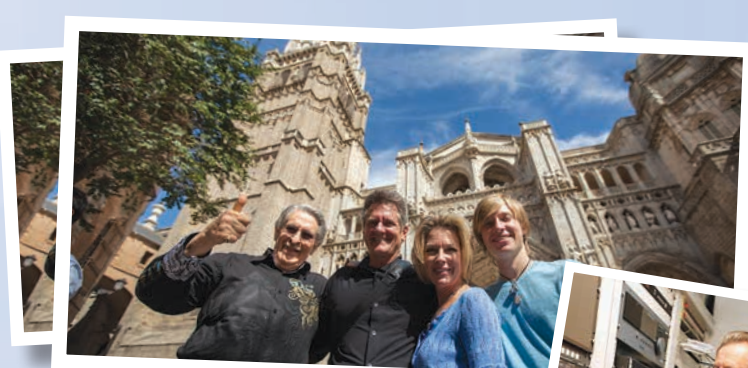
It's 'thumbs up' from the heart of Madrid where TBN just purchased 7 new TV stations to reach Spain.