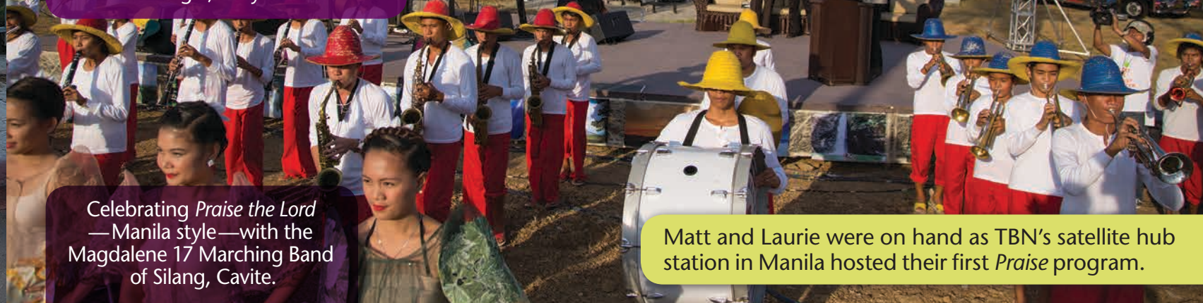
Celebrating Praise the Lord —Manila style—with the Magdalene 17 Marching Band of Silang, Cavite.