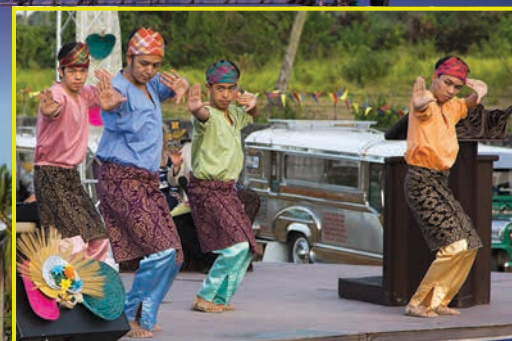
Praise and prayer expressed in dance.