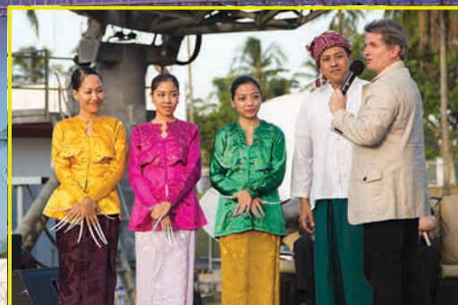
Members of the Kaloob Philippine Dance and Ministries troupe.