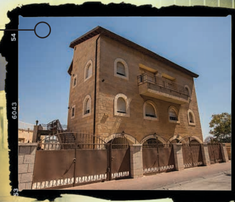
TBN's new studio on Giv'at Hananya—the Hill of Grace—in Jerusalem.

Rooftop satellite receiving dishes blanket the landscape in Jerusalem.