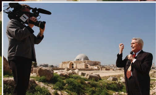
Proclaiming the name of Jesus in Amman, Jordan.