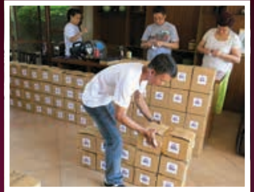
Boxes filled with emergency relief goods were gathered at the TBN-Asia offices in Manila.