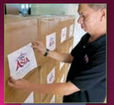
A TBN-Asia staff member prepares relief boxes.