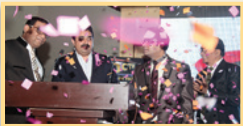
Praise and worship—along with fireworks and confetti—marked the festivities as JCTV-Pakistan joyfully celebrated its launch on the ABS-1 satellite this past November.