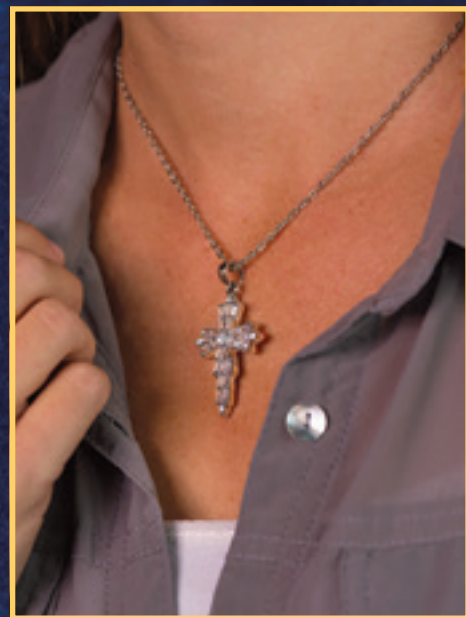
ACTUAL SIZE OF CROSS: 1.125" (W) X 1.5" (H)

Your gift to TBN or Praise-A-Thon pledge will bring this beautiful cross necklace to you during this month of June only. It comes with our love and thanks for helping us take the message of the Cross to the whole wide world!