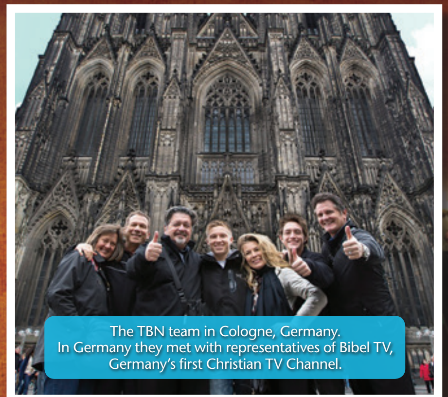
The TBN team in Cologne, Germany. In Germany they met with representatives of Bibel TV, Germany's first Christian TV Channel.