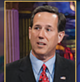
Former U.S. Senator Rick Santorum.