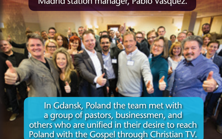
In Gdansk, Poland the team met with a group of pastors, businessmen, and others who are unified in their desire to reach Poland with the Gospel through Christian TV.