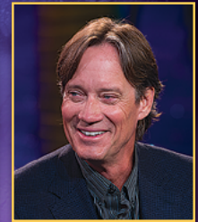
Actor, director and producer — Kevin Sorbo.