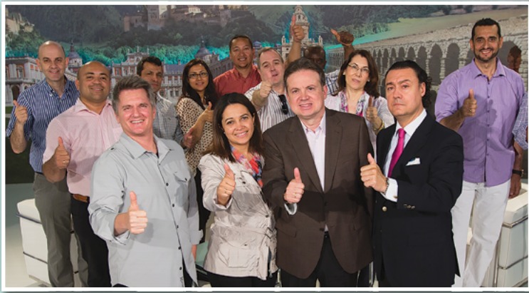
TBN España's Madrid studios produce life-changing Spanish language programs broadcast across Spain and throughout Europe.