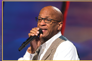
Grammy winning gospel singer and pastor of Perfecting Faith Church in Freeport, NY — Donnie McClurkin.