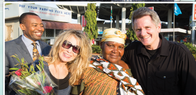
A warm greeting from TBN partners in Tanzania.