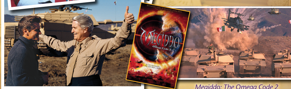
Megiddo: The Omega Code 2