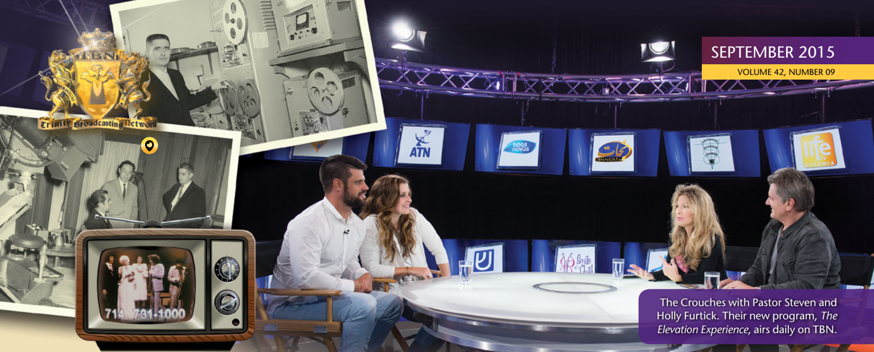
The Crouches with Pastor Steven and Holly Furtick. Their new program, The Elevation Experience , airs daily on TBN.