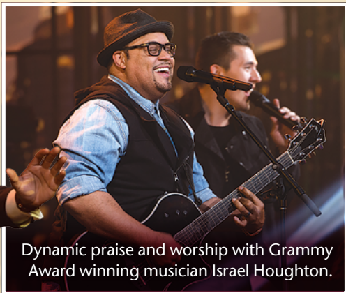
Dynamic praise and worship with Grammy Award winning musician Israel Houghton.