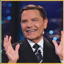
Renowned evangelist, author, and host of Believer's Voice of Victory —Ken Copeland.