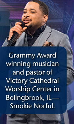
Grammy Award winning musician and pastor of Victory Cathedral Worship Center in Bolingbrook, IL—Smokie Norful.