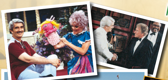
The Emissary: A Biblical Epic