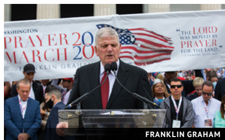
FRANKLIN GRAHAM

“TBN has covered many major prayer gatherings over