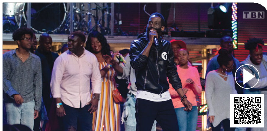
CHRISTMAS WITH TYE TRIBBETT AND FRIENDS. Award-winning gospel singer and songwriter Tye Tribbett welcomes a host of musical friends and guests for an inspirational evening of holiday worship taped at the Church of All Nations in Orlando, Florida's Holy Land Experience.