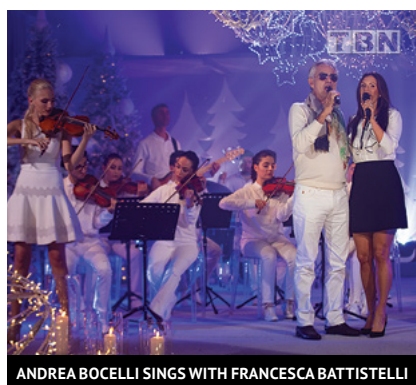
ANDREA BOCELLI SINGS WITH FRANCESCA BATTISTELLI

One of the world's most beloved classical vocalists and music stars, Andrea Bocelli performs select Christmas songs, along with music from his chart-topping album, Si . Filmed in and around Mr. Bocelli's hometown of Tuscany, the special includes