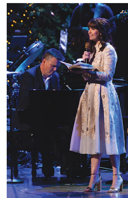
SING! AN IRISH CHRISTMAS. Join Ireland's own Keith and Kristyn Getty, known for modern hymns and carols such as In Christ Alone , for an exciting evening of carols and Christmas standards — all done with an Irish flair!