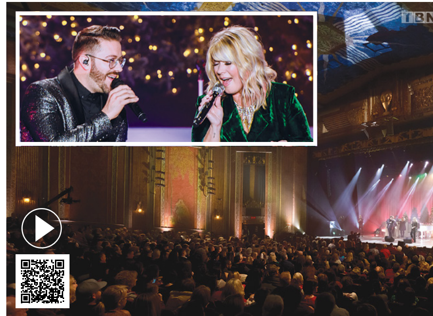
CELEBRATE CHRISTMAS WITH NATALIE GRANT AND DANNY GOKEY. Grammy nominated and Dove Award-winning artists Natalie Grant and Danny Gokey ring in the holiday season with their hugely popular Celebrate Christmas Tour , recorded live from the Paramount Arts Center in Ashland, Kentucky.