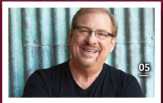
THE CHOSEN: Go behind the scenes of this television masterpiece!