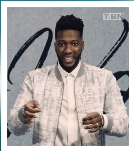
Pastor Michael Todd premieres an exciting new series on TBN! (page 4)