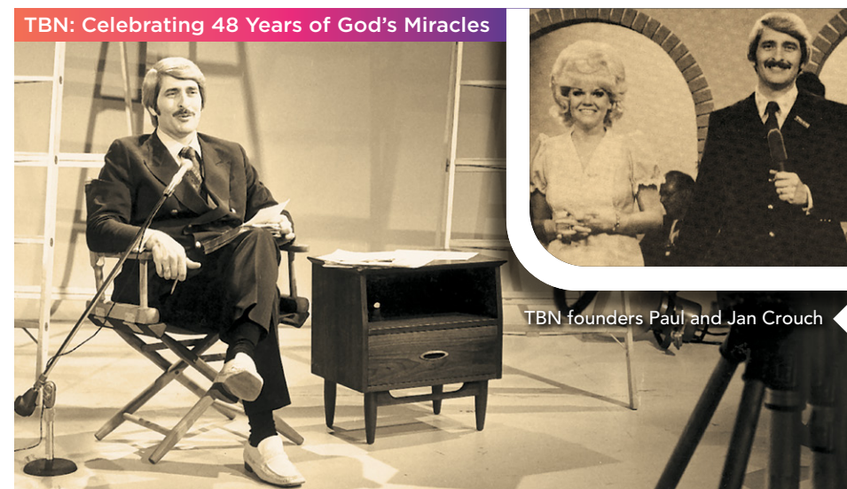
Paul Crouch hosts one of TBN's first programs on a simple, makeshift set.