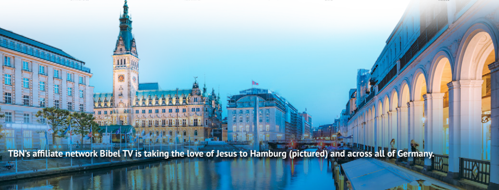
TBN's affiliate network Bibel TV is taking the love of Jesus to Hamburg (pictured) and across all of Germany.