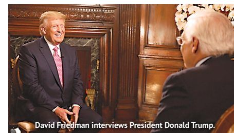
David Friedman interviews President Donald Trump.

While the mainstream media largely ignored covering the historic agreements, TBN is producing