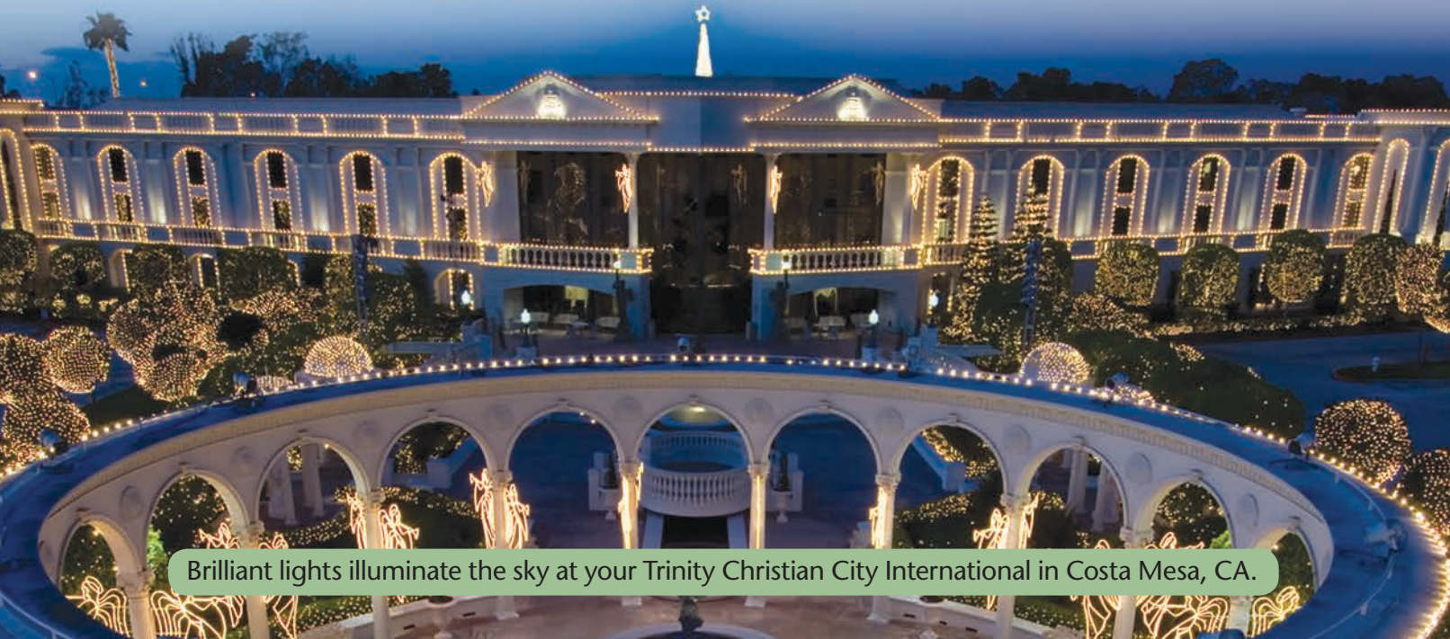
Brilliant lights illuminate the sky at your Trinity Christian City International in Costa Mesa, CA.

For more information please see your local listings or go to www.tbn.org .