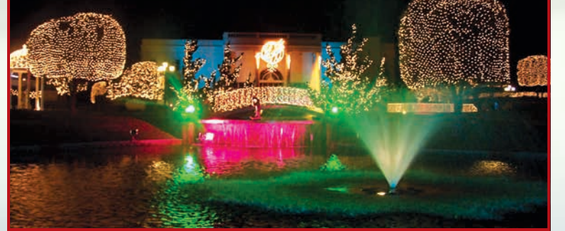
Angel Park at the Int'l. Production Center in Irving, TX.