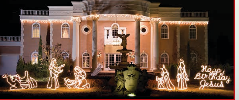
Our Atlanta, GA station is ready for Christmas!

Join your worldwide TBN family this holiday season as we celebrate Jesus' birthday with beautiful Christmas programs and specials!