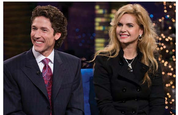
Joel and Victoria Osteen