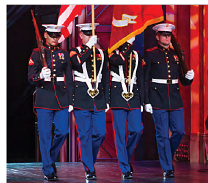
United States Marine Corps Color Guard.