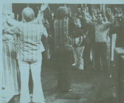
THIS IS TELETHON?? PRAISE THE LORD! LOOKS LIKE REVIVAL TO ME!