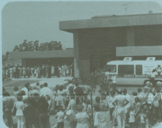
7,000 PARTNERS TOUR TBN HOME & MOBILE VAN-