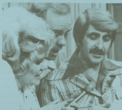
$1,000.00 FROM TEHATCHED!" PTL LOOK AT JIMS EYES!