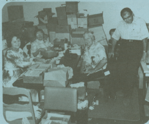
THE HEART OF TBN - THE MAIL ROOM WORKERS - GOD'S BEAUTIFUL PEOPLE - WE LOVE YOU!