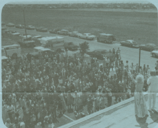
PARTNERS JOIN HANDS AROUND ENTIRE BLDG. FOR DEDICATION!