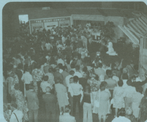
HOSTS KNEELING TO INVITE THE HOLY SPIRITS' DIRECTION-