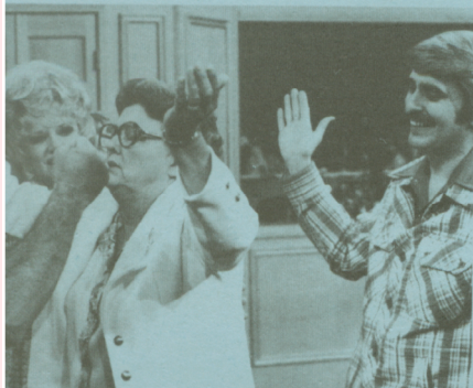
RECEIVED HER. "HEAVENLY LANGUAGE OLIVE TV DURING THE TELETHON!