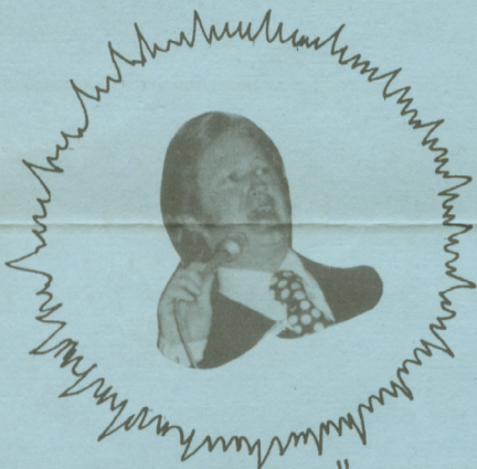
"DWIGHT THOMPSON" PREACHING "OLD TIME PENTECOST." "ONE MORE TIME" REVIVAL SERMON