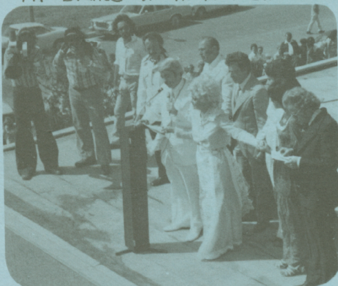
DEDICATED TO JESUS-"IN THE NAME OF THE FATHER, SON AND HOLY SPIRIT" AMEN! P.T.L.!