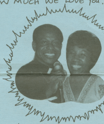
"ED & ELLA" AND ALL THE "TBN HOSTS" WILL BE SHARING JESUS IN A VERY SPECIAL WAY.