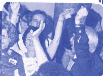
OLD TIME PENTECOST IN THE UPPER ROOM ON MT. ZION!