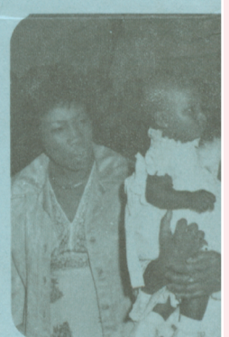
Have you ever seen such a YOUNGEST TBN Partner at the Rally and grandma were enjoying the angel — and looked like a doll!