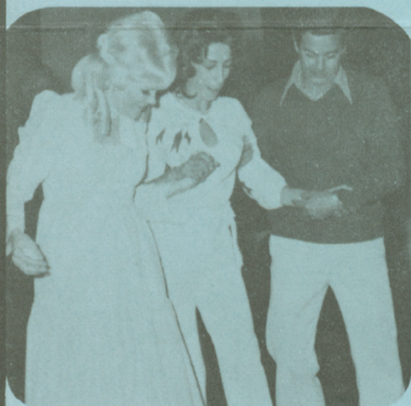
This beautiful TBN Partner was instantly healed by the power of Jesus as her husband laid hands on her at the Angeles Temple Rally! She had been told she had incurable Multiple Sclerosis — but Jesus healed her as she walked in front of all those partners — Proclaiming "Jesus Is Here — He just touched me and I am every bit whole".