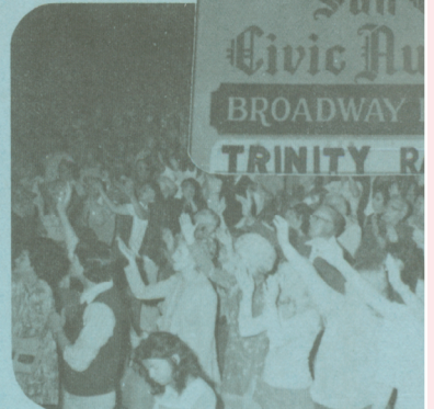
2,000 Beautiful TBN Partners PRAISING THE beautiful SAN GABRIEL RALLY. As the PRECIOUS HOLY SPIRIT filled the room with PRAISES TO JESUS for half an hour. It was heard him preach — it was beautiful. Don't miss

HERE ARE SOME OF THE FULL-TIME VOLUNTEERS