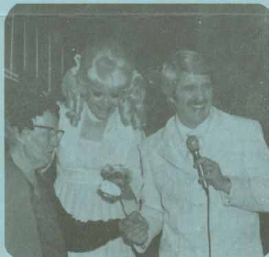
We always give special gifts to our partners at the rallies as they are giving to their TV Station. A special gift went to this precious angel who was our oldest TBN Partner at the Rally. Can you believe she was 98 years young — She was an angel and had the love of Jesus all over her beautiful face.