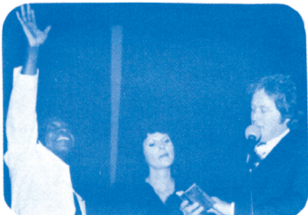
"Go ye into all the world"