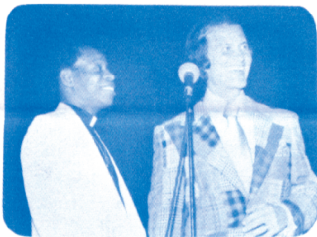
Pat Boone and his coat of many colors