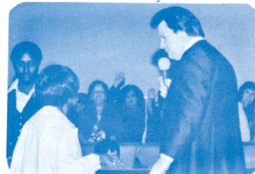
"Rise & be healed in Jesus' Name"