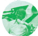
Sea o' Galilee