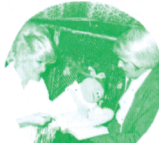
Lil' Bush at Manger