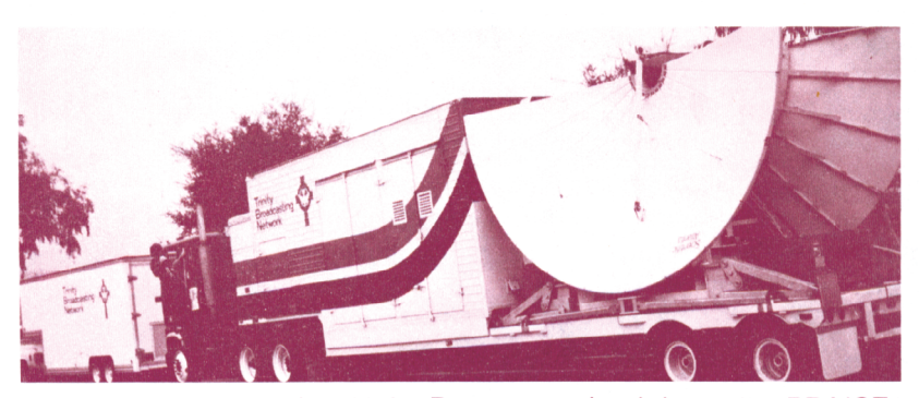
Glory! We will send the Holy Beamer and originate live PRAISE!

Partners — WE ARE WINNING! Let's keep going in Jesus' Name!