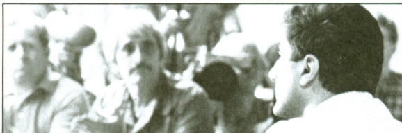
Christian media leaders from 10 nations met with key Lebanese leaders. Here Paul Crouch leads the press conference with Basheer Gemayel, commander of the Lebanese Forces. General Gemayel called for the removal of PLO and all Armed Forces from Lebanon.