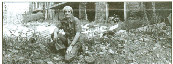
The tragic "Green Line" which separates East and West Beirut. Now a "No Man's Land". PLO still hold West Beirut. Pray for the Peace in Lebanon.