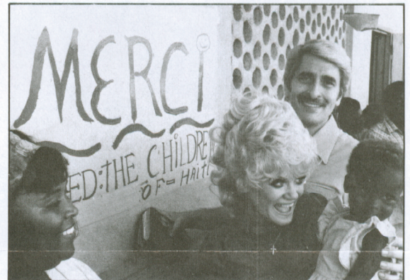
MERCI! signed the children of Haiti. Thank you for FOOD, DOLLS AND ETERNAL LIFE! They will never forget you cared!