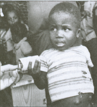
Machine, Machine—little boys who know you love them! Thank you from our babies in HAITI—over 20,000 machines and dolls went to HAITI and we helped distribute them for you—what a joy!