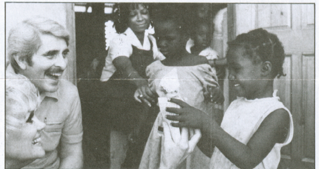
Bébé, Bébé—a little doll for a little doll. These children know that you love them because we did something about their hunger and their nakedness and their hopelessness! We have fed them, clothed them and told them about JESUS!