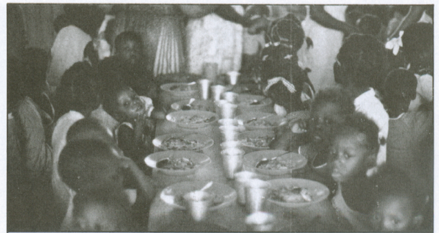
640 little angels ate the day we were in Haiti. Every day they eat food provided by YOU —they patiently wait until all are seated, bow their heads and thank Jesus for the food—then eat!