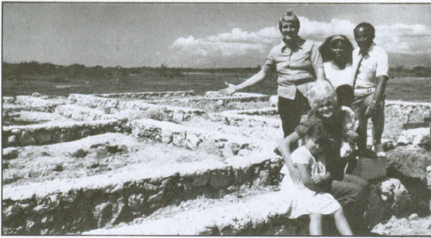
The beautiful new HAITIAN ORPHANAGE is on its way. Homeless children will have a home because YOU care. Jesus will ask us if we saw a stranger and took him in—and we can say, YES LORD!