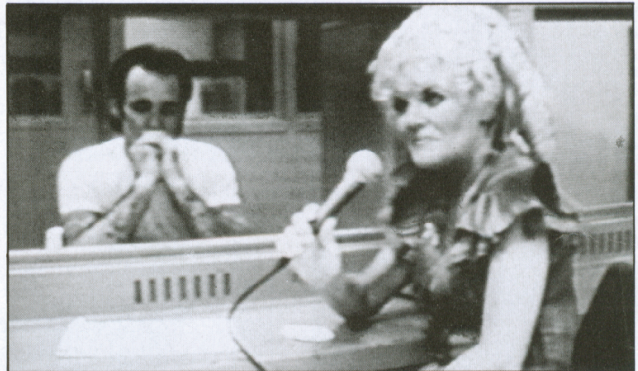
We have seen a miracle in the prisons. Many, many beautiful men and women have been saved watching TBN but the greatest joy is going into the prisons and letting these beautiful people know we do LOVE them and know they CAN MAKE IT!