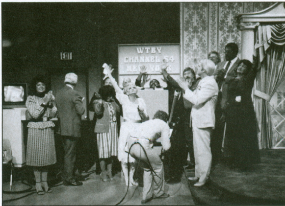
A prayer of dedication was followed by the anointing of the big switch that would send 24 hour Christian TV across the great Hudson Valley.