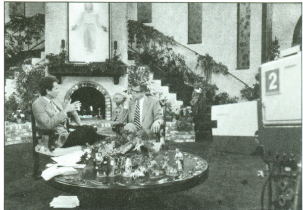
What a joy to welcome Chuck Colson to the Praise program recently. Thanks also to Dean Jones, who played the part of Chuck Colson in the movie "Born Again", for hosting.