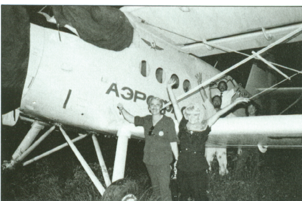
Russia's latest aircraft that had LANDED in GRENADA moments before our American Marines liberated the people. The Grenadians LOVE the American Marines. They Love the USA and they Love President Reagan for his courage in stopping a communist takeover in Grenada.