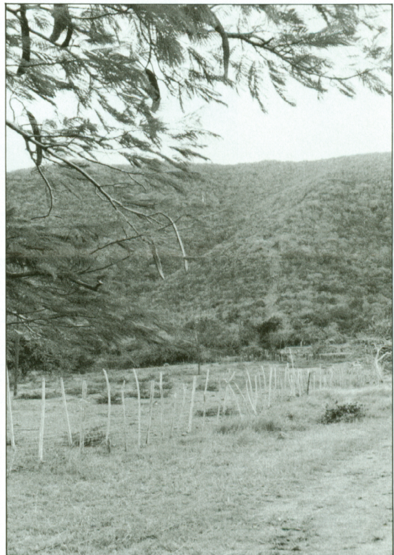
TRINITY MOUNTAIN on the North Shore of the Island of NEVIS! On this mountain will stand the Great Tower that will beam the gospel of Jesus to the Islands of the Sea.