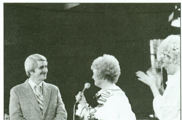
The sweetest lil' Gramma in the whole world, Dale Evans Rogers, joined us at Melodyland to sing & shout Gods Praises. Thank you Dale for your example of JESUS you've shown to the whole world!