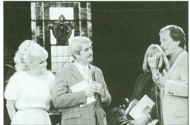
As ALWAYS, a joy to welcome Pat & Shirley Boone to TBN! They are very special to us! Always the same—Loving Jesus & wearing white shoes! Pat & Shirley and their entire family are BEAUTIFUL! Thank you for sharing with us!