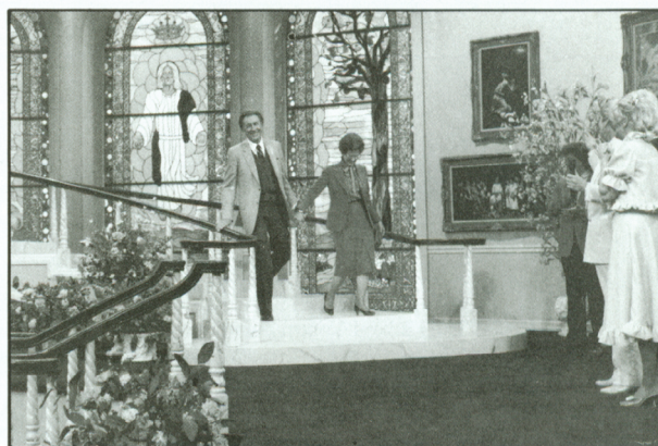
Dr. & Mrs. Roberts joined us as partners coast to coast joined in singing "Happy Birthday to You" Dr. Oral Roberts! What a joy to have them celebrate this special day with us! We love them so much.