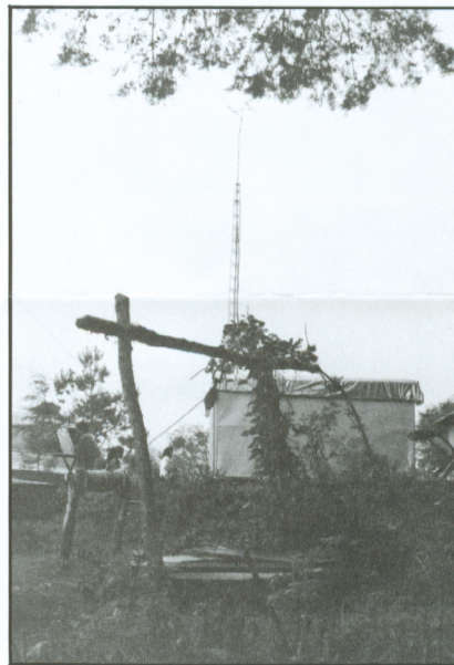
Ch. 21 Guatemala City, Guatemala ON THE AIR—giving the winds A MIGHTY VOICE— "Jesus salva . . . Jesus hace milagros . . . Jesus viene de nuevo!" Now we need more Spanish programming! We are already having SALVATIONS from our precious bros. & sisters in Guatemala! We are being missionaries in this WAR TORN land. Help us reach these precious people! Pray for Ch. 21. Designate funds for equipment & tape & production of SPANISH PROGRAMS. Help us keep JESUS ON 24 HOURS A DAY!