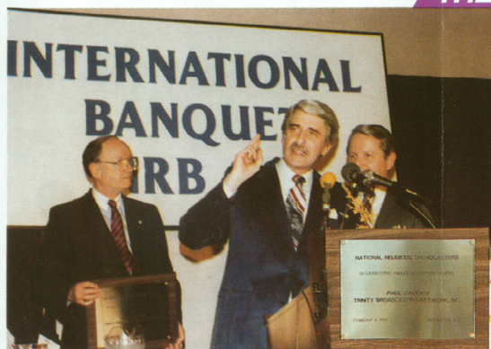
INTERNATIONAL PROGRAMMING AWARD