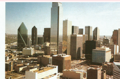
DALLAS TX CH. # 58