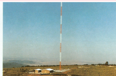
CH. 25 CISKEI SO. AFRICA