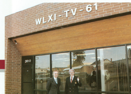
GREENSBORO N.C. CH. 61