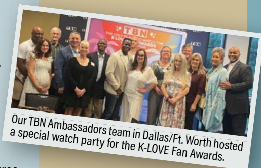
Our TBN Ambassadors team in Dallas/Ft. Worth hosted a special watch party for the K-LOVE Fan Awards.

No matter the size of your monthly gift, you’ll help keep this ministry strong, innovative, and impactful — ready to meet people where they are with the message of hope and grace through Christ.