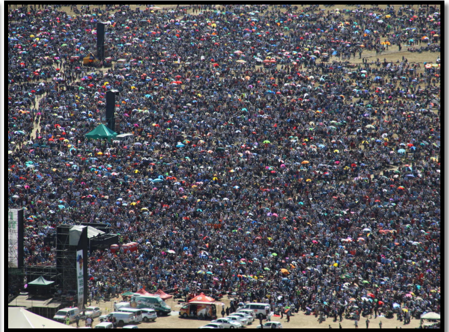
Over 1 million people gathered at the “It’s Time” National Day of Prayer