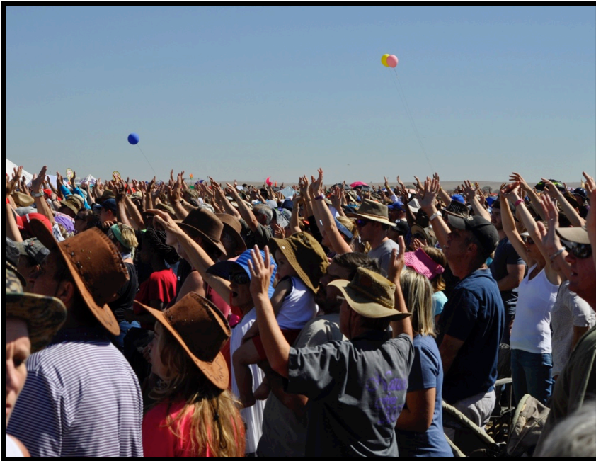
“It’s Time” National Day of Prayer