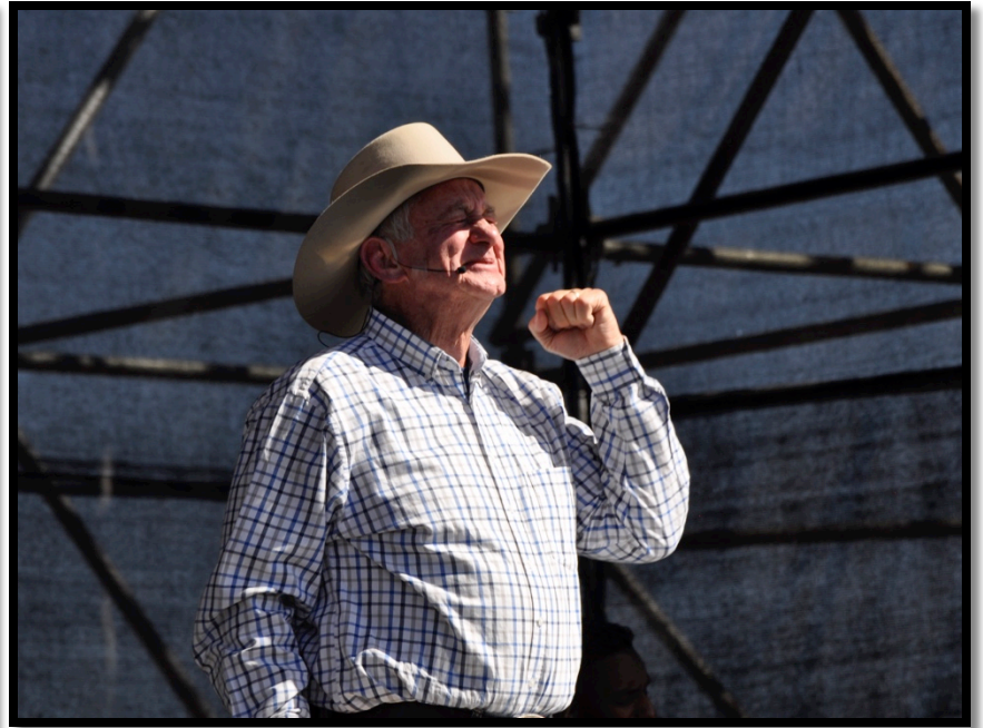
Angus Buchan – “It’s Time” National Day of Prayer