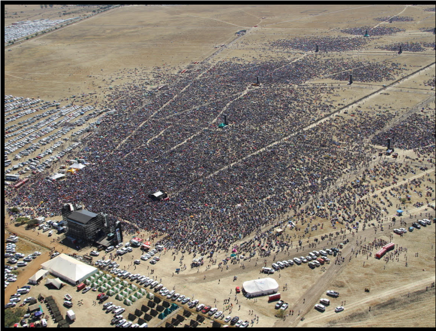
Over 1 million people gathered at the “It’s Time” National Day of Prayer