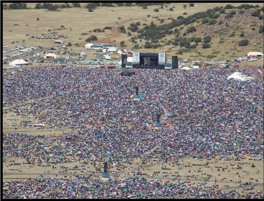
Over 1 million people gathered at the “It’s Time” National Day of Prayer