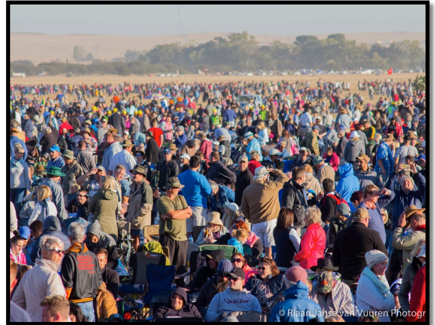
“It’s Time” National Day of Prayer