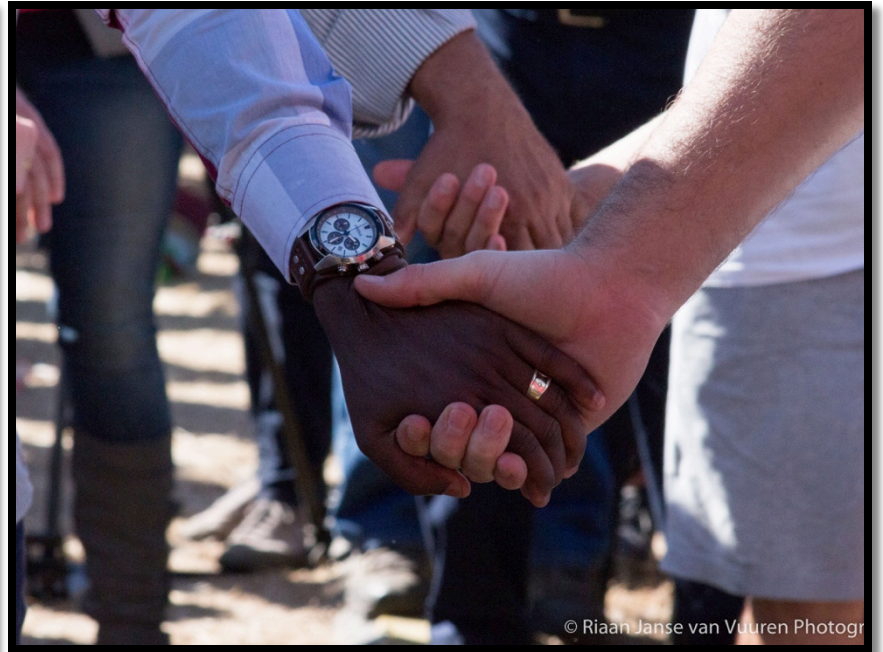
“It’s Time” National Day of Prayer