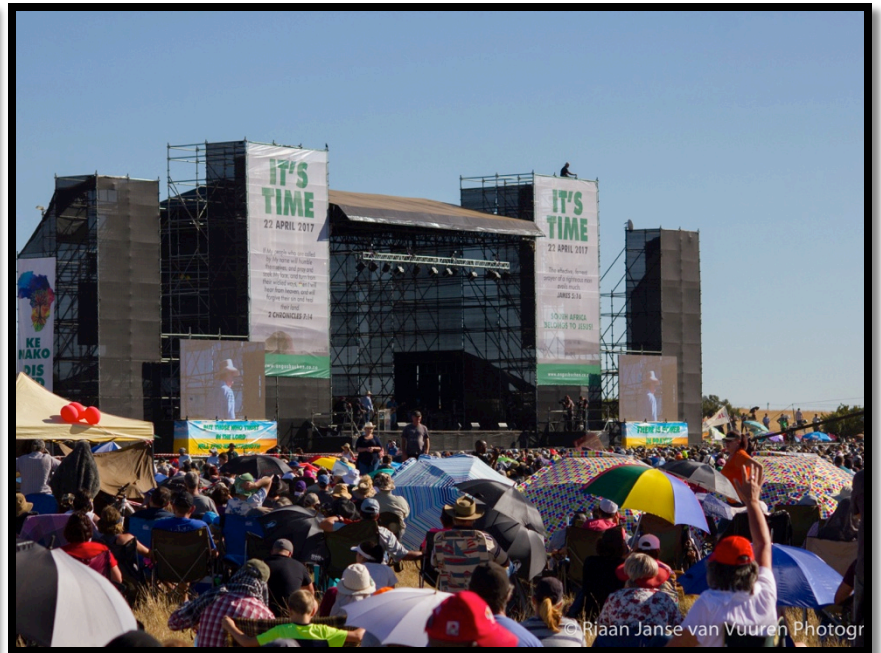
"It's Time" National Day of Prayer