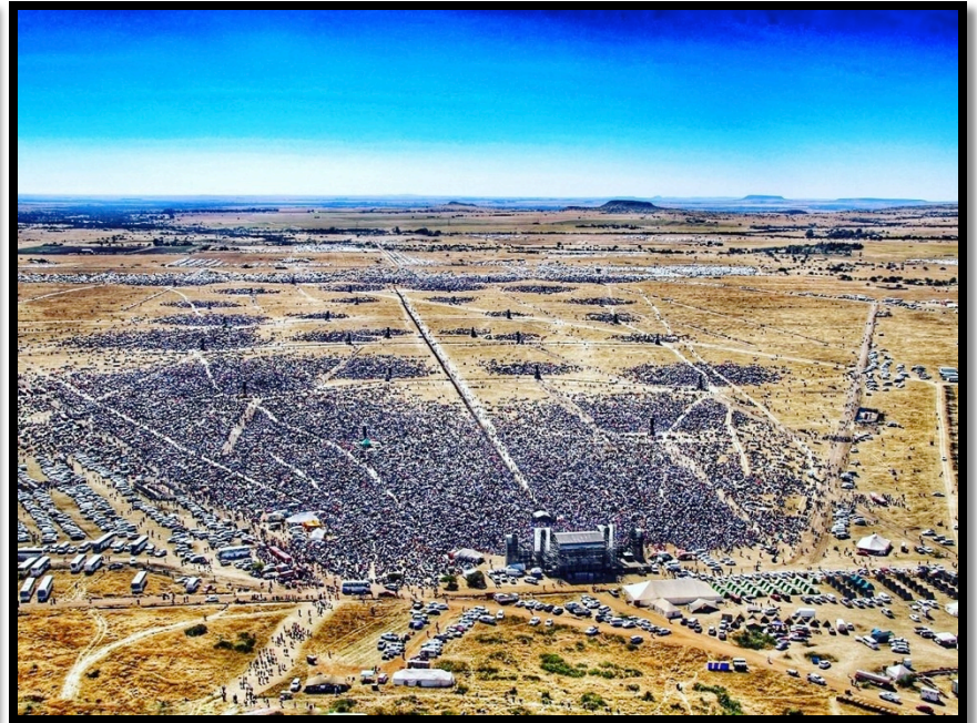
Over 1 million people gathered at the “It’s Time” National Day of Prayer