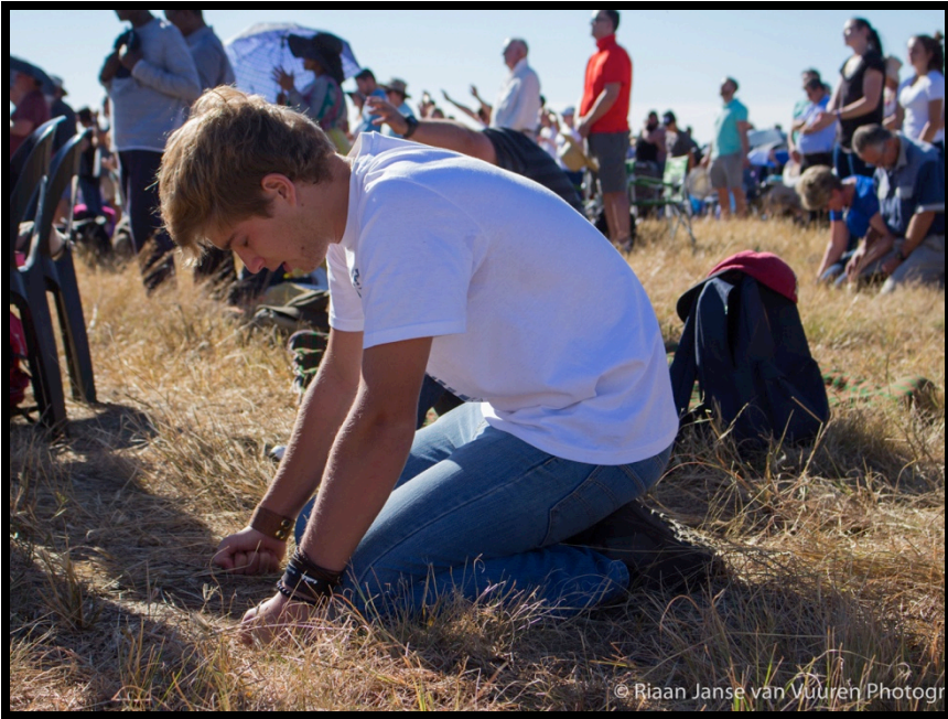
“It’s Time” National Day of Prayer