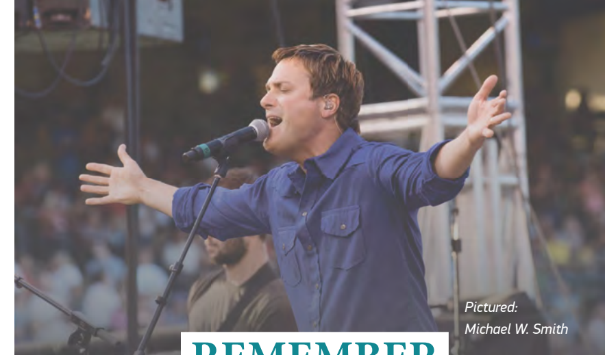
Pictured: Michael W. Smith