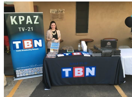
KPAZ participated in the Ignite, Unite, Serve" event.

TBN was on hand to distribute copies of the book The Call: 40 Years of God's Ministry to the first hundred individuals who stopped by our table. We also used the event to promote KPAZ's presence on social media. Many people came by our table and "liked" our page on Facebook.