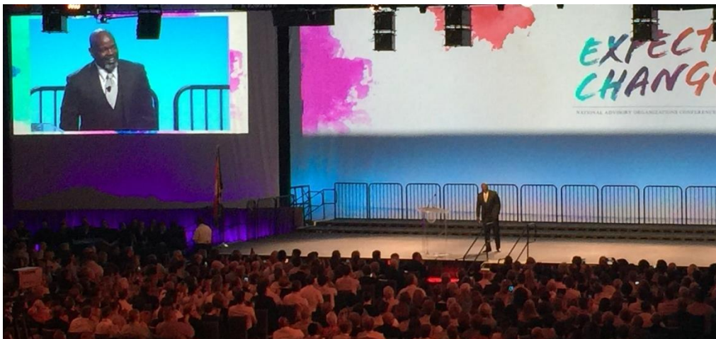
Former NFL running back, Emmitt Smith shares that the Salvation Army NAOC Conference about what it means to be Christ's hands and feet in this world.