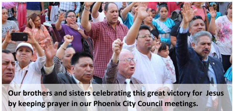
Our brothers and sisters celebrating this great victory for Jesus by keeping prayer in our Phoenix City Council meetings.