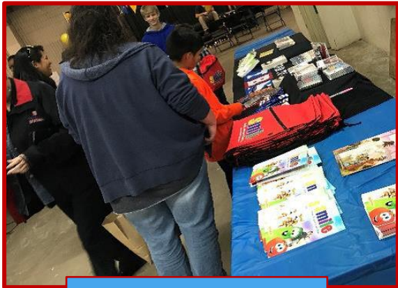
Whiz Kids Rodeo Festival.