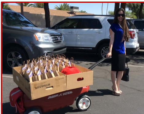
"Family Day" at Grace Christian Academy.

SMILE has had another great month of promotional opportunities with station managers attending local events & outreaches. We've been able to send the new SMILE Cinch bags along with brochures and pens to help with promoting SMILE. SMILE was promoted at the Whiz Kids Rodeo Festival by KPJR-TV 38, Westminster, CO. TBN Phoenix promoted SMILE at Grace Christian Academy at the "Family Day" event.